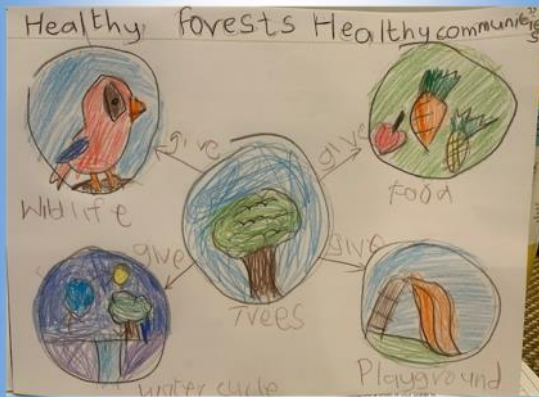
Vaibhav Vadrevu K - 1 Grade Category Waxpool ES